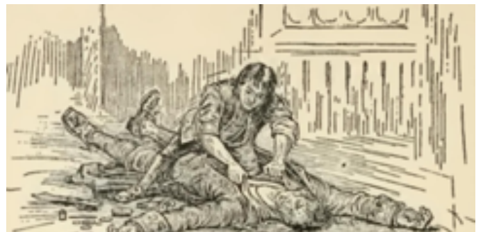
Image: Artist impression of the death of Billy Bones - Captain staying at the Benbow Inn.